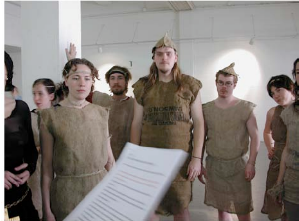
© Maria Pask, "Starhawk! The musical, 2004, video installation, courtesy Ellen de Bruijne Projects

Shadow Cabinet (three rendezvous) brengt documenten, kunstwerken en films samen, die een veelzijdige blik geven op grenspraktijken, waar bepaalde politieke en artistieke agenda's onlosmakelijk verbonden zijn met elkaar. Deze achterliggende ideeën worden bron van een wekelijks ontmoetingsplatform. Hartelijk welkom.