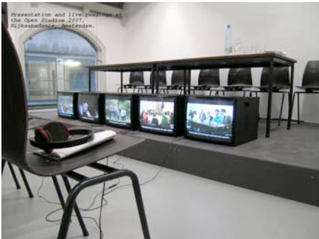
"Speech as a political act" performance/installation/booklets, 2007/08

In the project 'Speech as a Political Act', different groups of speakers address notions around freedom, civil liberties (including freedom of speech and expression), the development of political convictions, who does and doesn't have a voice in the public domain, the legitimacy of the public speaker, and so on. Starting-point for this work is a public debate between individuals who can be described as left-wing and right-wing anarchists. It took place at Casco Projects, Utrecht in 2007. The debate was transcribed, turned into a theatrical script and read out by a panel of five academics during the Critical Legal Conference at Birkbeck School of Law, London. The debate that evolved after the reading was again transcribed and added as a new act to the script. Subsequent readings in different oral arenas involved actors, free speech activists, young students and art professionals. They followed the same procedure of reading and discussing, causing a snow ball effect that lead to a series of video registrations and a final seven act script entitled 'Speech as a Political Act'. Next act will take place as our first rendezvous on the opening day of the Shadow Cabinet.