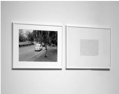
Peace installation text/ photo

A historiography of the peace sign translated into a photo and text installation.